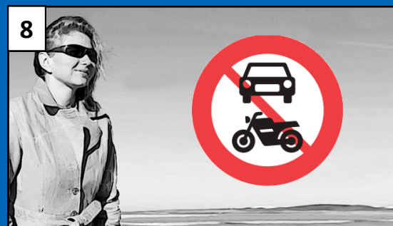
8 The drops make your eyes sensitive, so bring sunglasses and don't drive for up to 4 hours