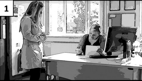
1 Make your way to the venue and let Reception know you have arrived