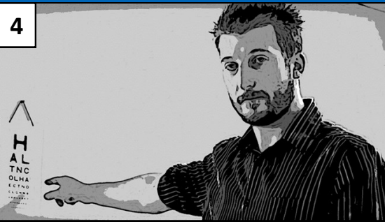
4 The Screener will ask you to read an eye chart