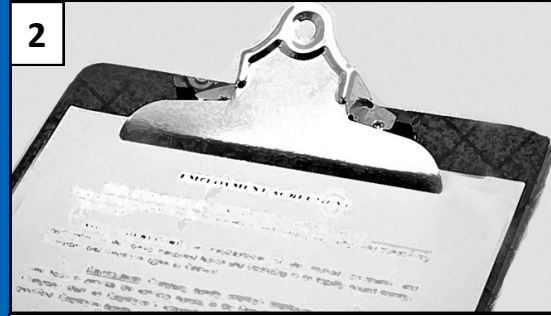
2 Read carefully and sign the consent form, if you have any questions ask your Screener