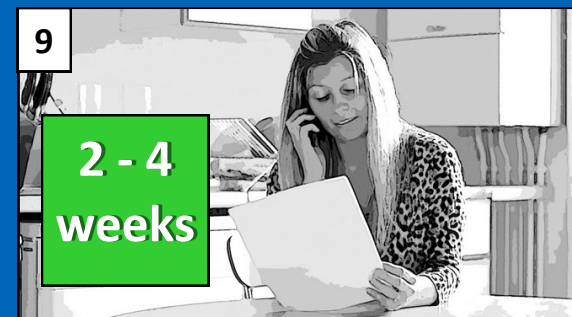
9 You will receive your result letter within a few weeks of your appointment