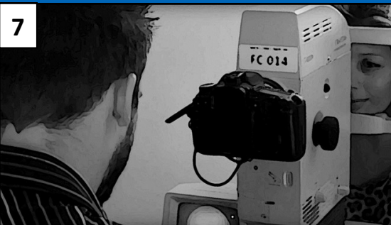
7 After 15-20 minutes, the Screener will take a photograph of the back of your eye (retina)