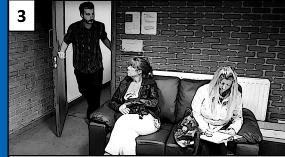
3 The Screener will come and collect you for your appointment